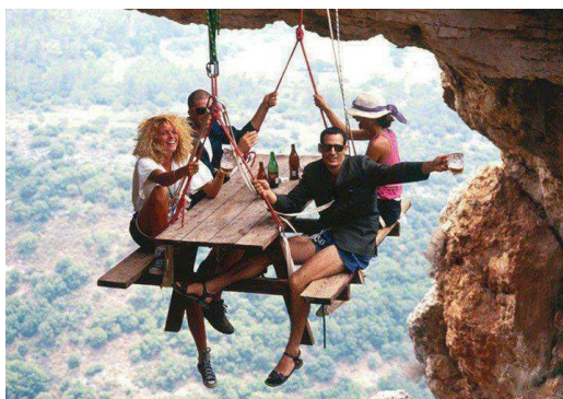
For some reason, the PCMG team preferred to dial in to Committee meetings.